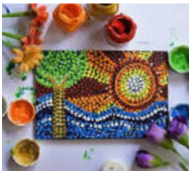
Sea and sun

Here are some ideas below if you can't decide what to paint.